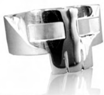
ring, polished / ME9 0004