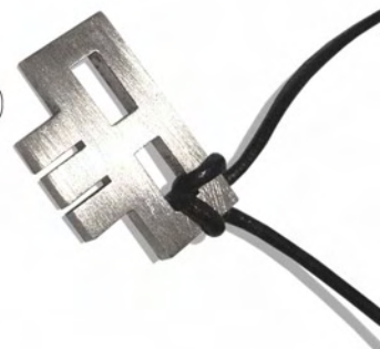
pendant / ME9-0008