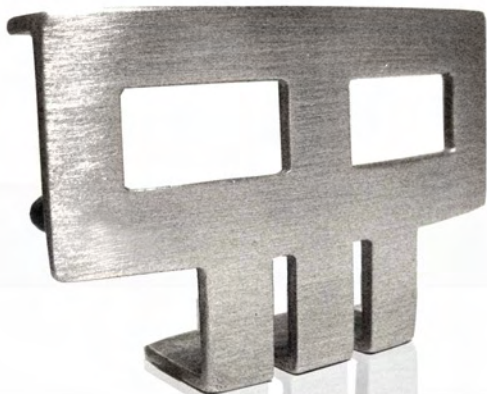
small / lines-grinded / ME9 0007-01