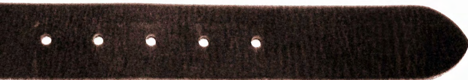
leather-belt, brown / B 0007