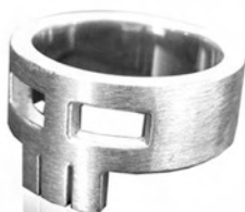
ring, lines-grinded / ME9 0004-B